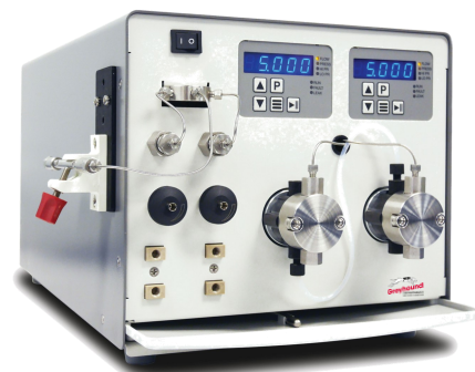
Pump shown with degasser

The customisable Binary Gradient Pumping System is an advanced pumping system for two-solvent high-pressure gradient applications. The system is designed with two single-head positive displacement piston pumps integrated into a functional enclosure.